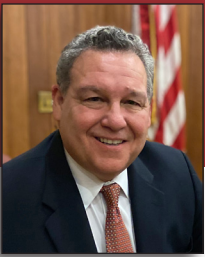
Mayor Joseph P. Scarpelli