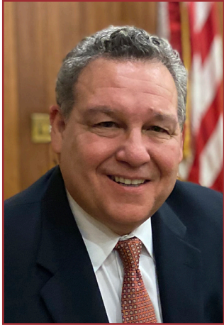
Mayor Joseph P. Scarpelli